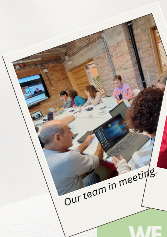
Our team in meeting.

Next Steps: We will continue collaborating remotely, with monthly online meetings. Our next in-person gathering is scheduled for May in Ireland!