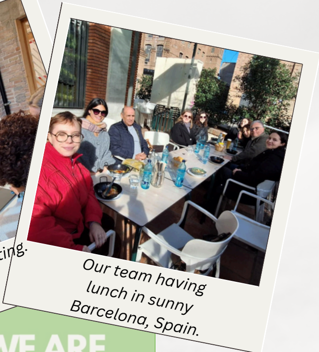
Our team having lunch in sunny Barcelona, Spain.