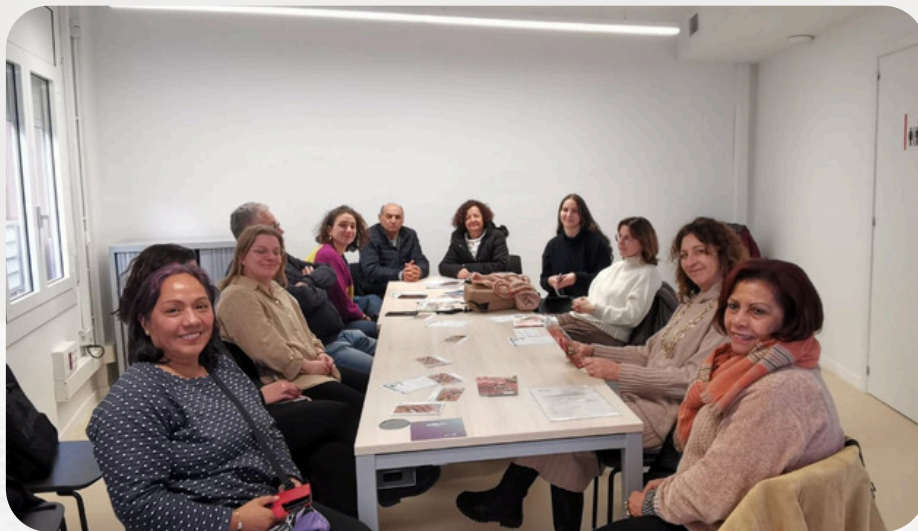
Our team during the kick-off meeting in Corbera de Llobregat, Spain.

Why: Increasing demographic shifts call for urgent reforms in care systems. People in need of care deserve the right to make their own choices and participate actively in society. Informal caregivers often lack the skills and support necessary for their demanding roles.